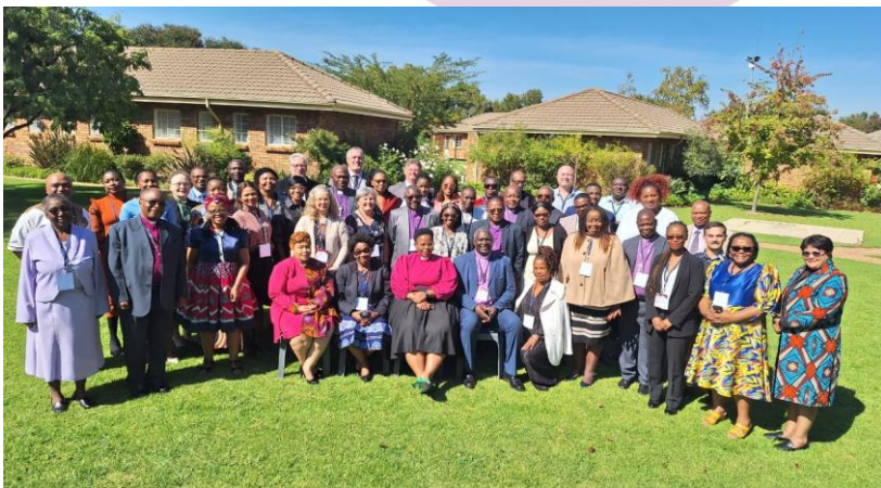
LUCSA Council Meeting 2024 Delegates

Council 2024 further acknowledged Sexual and Gender-Based Violence and Femicide (SGBVF) and that it be declared as a pandemic and that Member Churches to act appropriately.